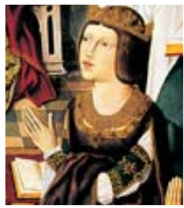
“KING ISABELLA” 1451–1504

Queen Isabella, who played a central role in European exploration by sponsoring Christopher Columbus's voyages to the Americas, made her mark on the Old World as well. As co-ruler of Spain, Isabella participated in her country's religious and military matters.