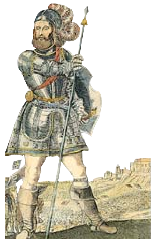
▲ Prince Henry the Navigator

Prince Henry’s curiosity was typical of the “noble spirit” of the Renaissance , (rĕn’ĭ-sāns’) a period when Europeans began investigating all aspects of the physical world. The term Renaissance means “rebirth” of the kind of interest in the physical world that had characterized ancient Greece and Rome. With his burning desire for knowledge, Prince Henry helped launch the era of European expansion.