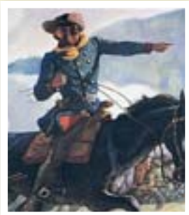
SAM HOUSTON 1793–1863

Sam Houston ran away from home at about age 15 and lived for nearly three years with the Cherokee. He later fought in the U.S. Army, studied law, was elected to Congress, and became governor of Tennessee.