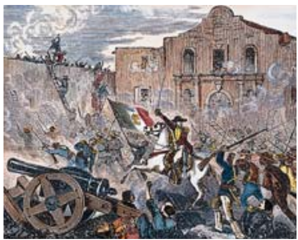
Henry Arthur McArdle conveys the brutality of the fighting in Dawn at the Alamo , painted between 1876 and 1883.