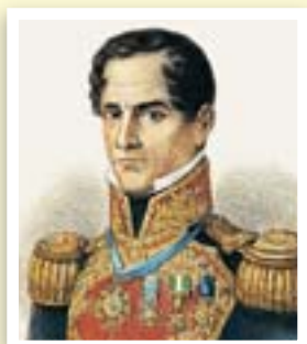
SANTA ANNA 1795–1876

Antonio López de Santa Anna began his career fighting for Spain in the war over Mexican independence. Later, he switched sides to fight for Mexico.