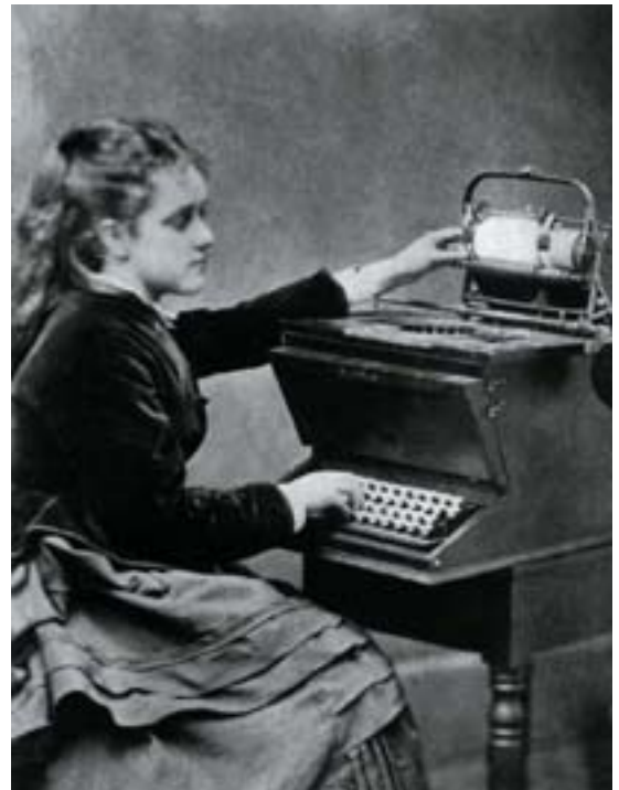
▲ The typewriter shown here dates from around 1890.

Industrialization freed some factory workers from backbreaking labor and helped improve workers' standard of living. By 1890, the average workweek had been reduced by about ten hours. However, many laborers felt that the mechanization of so many tasks reduced human workers' worth. As consumers, though, workers regained some of their lost power in the marketplace. The country's expanding urban population provided a vast potential market for the new inventions and products of the late 1800s.